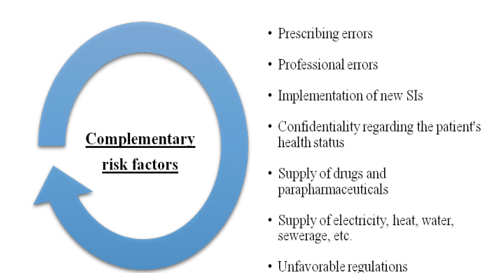
Fig. 1. Complementary risk factors [17].

Satisfactory working conditions contribute to both the physical and mental well-being and professional performance of pharmacists. That is why it is important to promote the creation and implementation of an adequate and comfortable working environment – a working environment that favors the quality of the pharmaceutical assistance provided to patients. Other factors that generate risks in the community pharmacy are shown in figure 1.