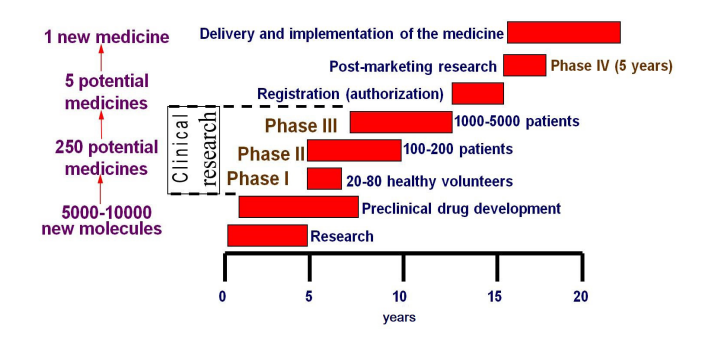
Fig. 2. The process of clinical research of new drugs (typically exceeding 10 years).

drug-to-drug synthesis, to its implementation in the clinic, is quite complicated and long-lasting (10-12 years), of great responsibility and costly, requires enormous investment. The total cost of the research project exceeds US $ 350 million (fig. 2).