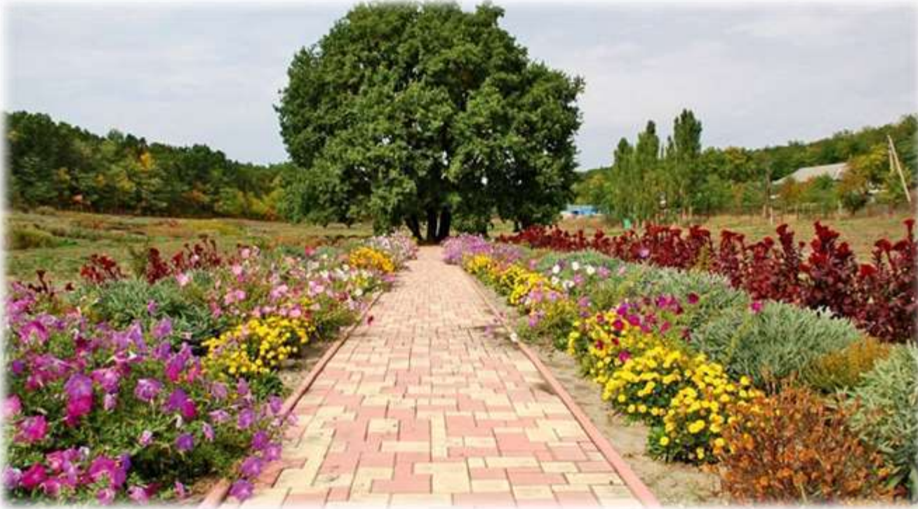
Fig.2 Scientific Center for the Cultivation of Medicinal Plants "Nicolae Testemitanu" SUMPh, Republic of Moldova