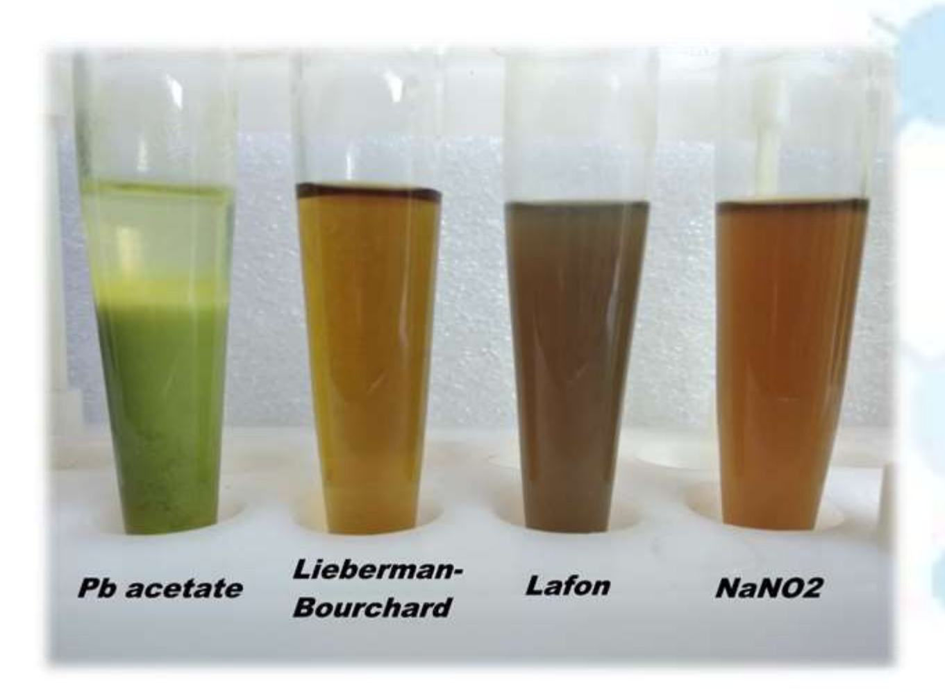
Fig.5.2 Qualitative reactions for saponosides