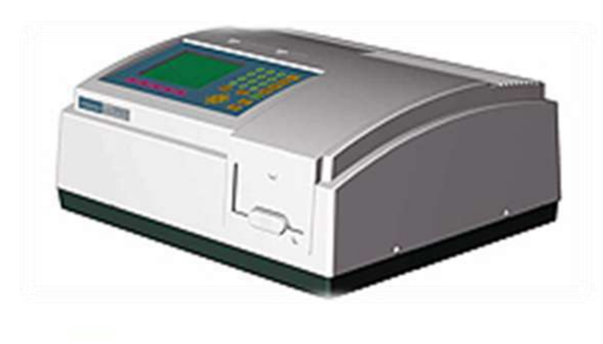
Fig.3 The spectrophotometer - Metertech UV/VIS SP 8001