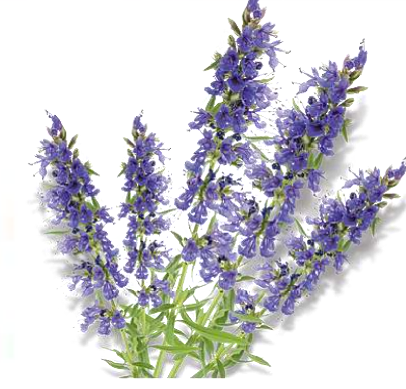
Fig.1 Hyssopus officinalis L.

Hyssopus officinalis L. (hyssop), a species native to the Caspian Sea region, has been cultivated in the Republic of Moldova as aromatic plant and has been used in folk medicine as antitussive, expectorant, carminative, digestive and sedative remedy.