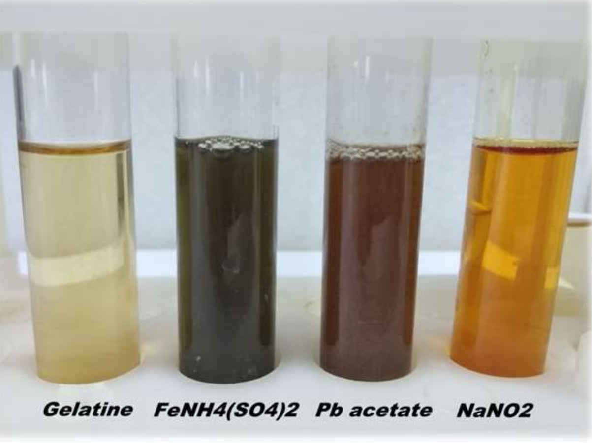
Fig.4 Qualitative reactions for tanins

Through qualitative reactions, in Hyssopi herba, tannins, flavonoids, saponosides were identified and the lack of alkaloids, coumarins and anthracene derivatives were confirmed. From the vegetal product were obtained 2 extracts: 30% ethanolic and aqueous; the THA was quantified by spectrophotometric method, expressed as chlorogenic acid. The THA were higher in ethanolic extract (3.64%) compared to aqueous (2.67%).