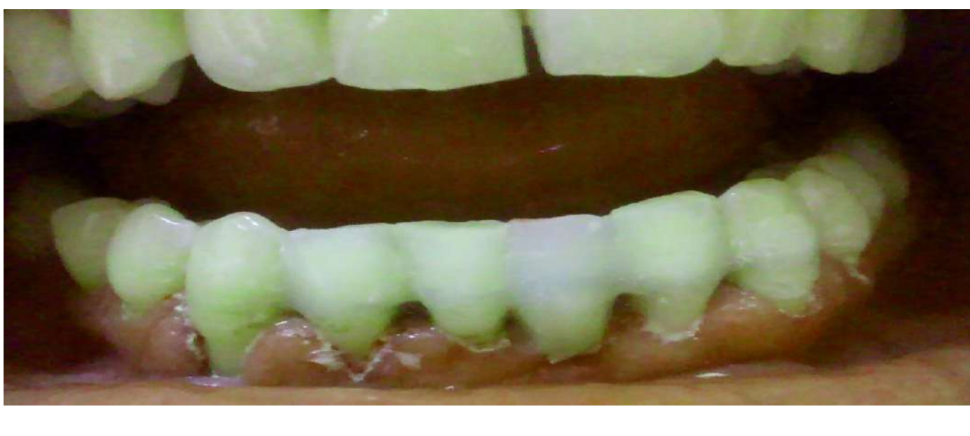
Figure 2. Clinical case 1 – fix splinting.

Figure 4. Clinical case 2 – removable splinting.