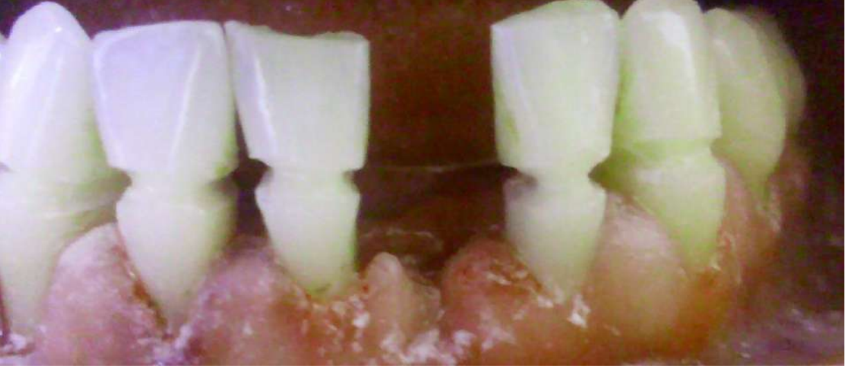
Figure 5. Clinical case 3 – before adhesive system applying.

Figure 3. Clinical case 2 – before treatment.