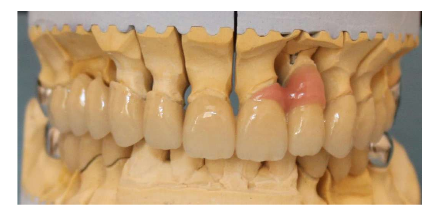
Figure 6. Clinical case 3 – adhesive splinting.