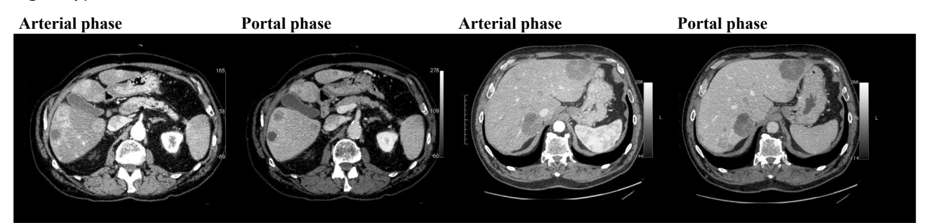
Fig. 1. Typical behavior of FNH-like nodules.

First typical pattern of endocrine metastases . Note hypervascular enhancement at arterial phase and the hypovascular washout at portal venous phase.