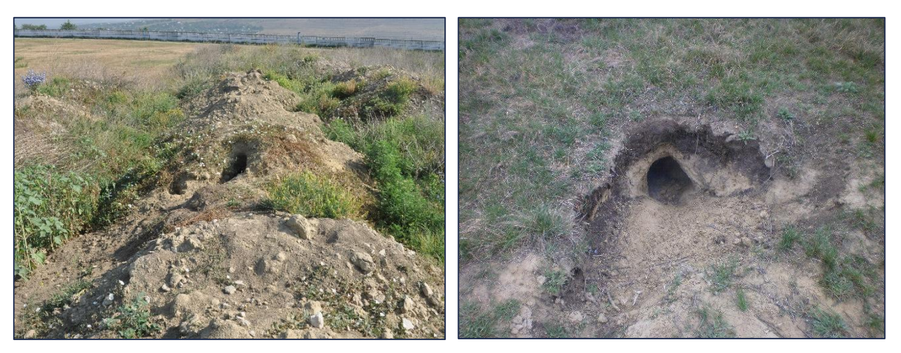
Figure 3. Mounds of sand and gravel with several fox burrows and a fox burrow in the south-western part of the airport.