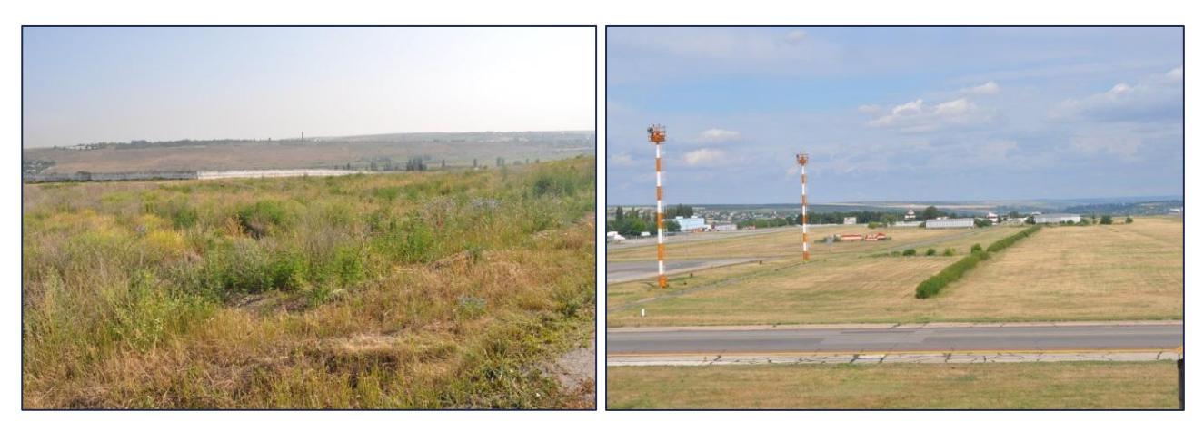
Figure 1. Open type biotopes in Chisinau airport.

The Chisinau airport is situated at the altitude of 122 m, with coordinates 46°55'40"N 28°55'51"E in the eastern part of the city, extending on a surface of 4271 m<sup>2</sup>. The studies were performed during 2012-2014 on the territory of Chisinau airport and adjacent ecosystems. Within the airport, biotopes are represented by grasslands (mowed and unmowed), sectors with shrub vegetation and sectors with different types of technical buildings, including abandoned ones, tree vegetation near the buildings and several small water basins for technical purpose (fig.1). The adjacent biotopes are represented by various agroecosystems (orchards, vineyards, corn, sunflower and cereals), private gardens, sectors with buildings, forest belt, grasslands, fallow ground, wet habitats, as well as ecotones that create convenient transition zones to the airport many vertebrate animal species.