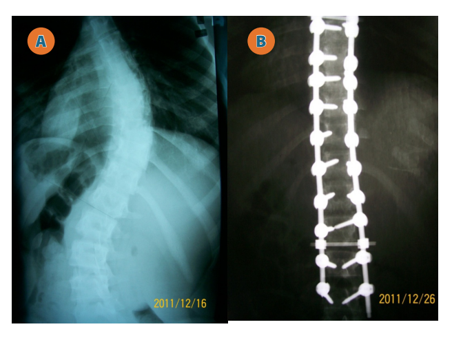
Fig 1. Before operation the angle of deformation was 70° (A) and after operation - 0 °, correction of deformation is 100% (B)

The I category – 26 patients with complete body growth (14-16 years) and idiopathic plentiful spine deformations was carry out one-stage dorsal correction (Fig 1).