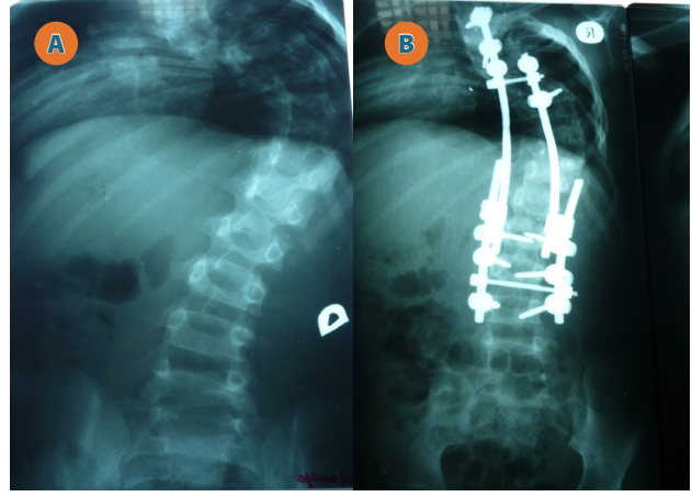
Fig. 3. Before operation (A) and after operation of "blocking spondylosyndesis" at curvature top with the following dorsal correction by "a growing construction" (B)

tem's distraction is carried out. One step of a distraction equals 1 cm. Intervals of stage-by-stage correction depend on age growth activity and rates of deformation advance: from 6 months to 1,5 years.