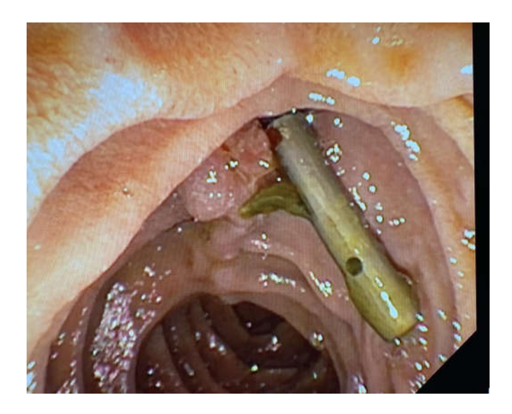
Tratamentul Litiazei Biliare Transpapilar Endoscopic Non-Radiant