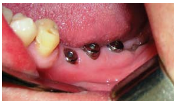
Fig.3.4. Healing abutment