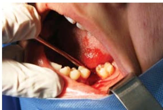
Fig.3.1. open flap

The aims of our proposed research are: determination the forces that is needed to insert the healing cap and the material that will act as enhancer for re-