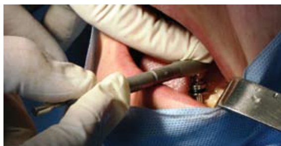
Fig.3.3. torque wrench