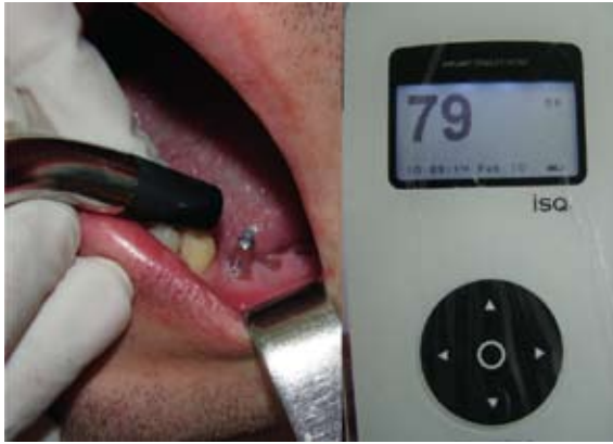
Fig. 3.6. Osstell measurement