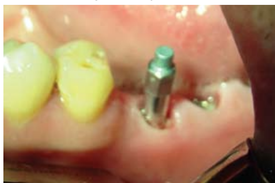
Fig.3.5. Smartpeg installed in the implant