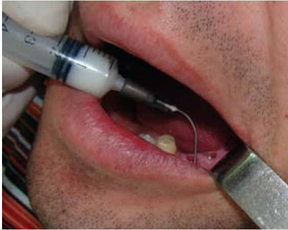
Fig. 3.7. levomecol injection

moving the healing cap with out any resistance torque or difficulties.