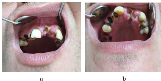
Fig. 3. Necrosis of the upper jaw after drug use of \alpha -PVP (a, b).

1. Based on the data from the literature studied as well as the clinical data, it can be concluded that jaw necrosis occurs against the background of various narcotic drugs containing