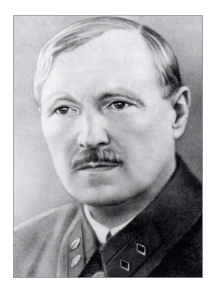
Fig. 1. V. N. Shevkunenko.

following net involvement of anatomists did not bring benefits in the direction of the studied problem and even it made this problem to be more difficult and currently only the behavior of the cervical fascia represents a difficulty for the classification and interpretation of cervical fasciae. Such authors as V. P. Vorobyov (1932) quotes the complete expression, in principal, philosophical or with moral, practical sense in a minimum of intonation of Malgain'a, which became classical: "Cervical aponeurosis – this anatomical chameleon which appears every time in a new form as the result of the nib of each person who has tried to describe it". Even A. D. Pansch (1888) in "Essentials of Human Anatomy" said that the neck fascia is the subject of the anatomy that can be considered as being the most confused [2].