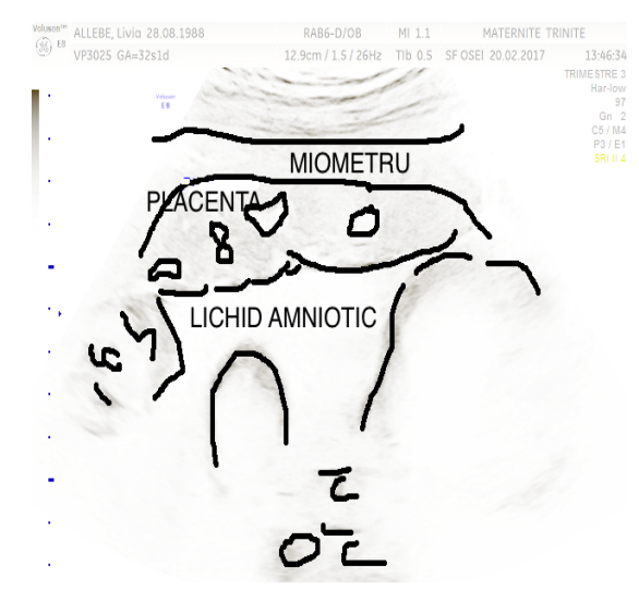
Fig. 2. Anterior placenta in the third trimester of pregnancy: hyperechoic placenta is surrounded by the hypoechoic myometrium, some calsifications and vascular lacks are seen.