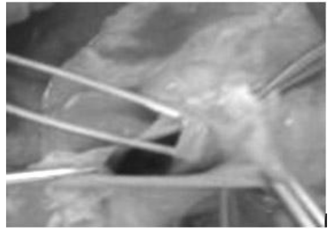
Fig. 2. Persisting Eustachian valve of 46-year-old-male.

The eustachian valve may be prominent in some individuals. Occasionally, this valve is large enough to produce obstruction to flow entering from the IVC. The IVC may be dilated, which suggests that the eustachian valve may be impeding blood flow from the IVC to the right atrium. One prior study