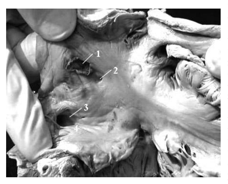
Fig.1. Photograph showing the Eustachian valve. 1-ostium of the superior vena cava; 2- ostium of the coronary sinus; 3- ostium of the inferior vena cava; 4-Eustachian valve.

There is a large variability in size, shape, thickness, and texture of the persistent eustachian