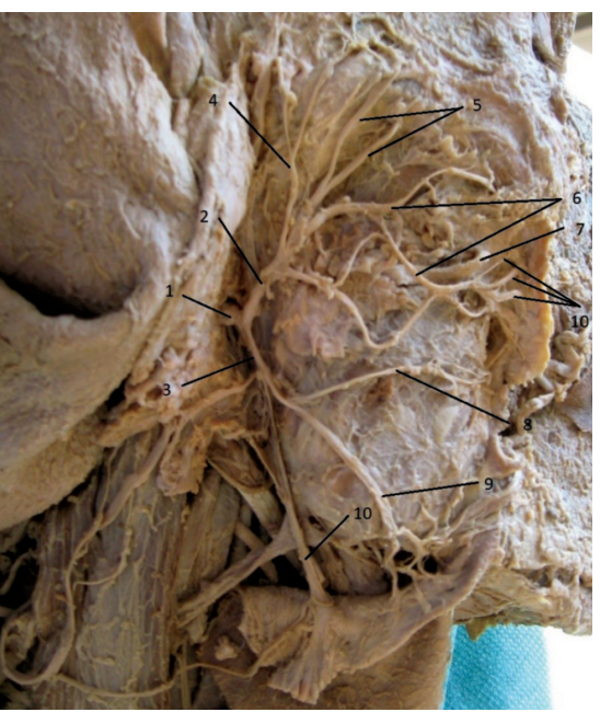
Fig. 2. Atypical branching of the extracranial part of the facial nerve. Type IV

10 – parotid duct; 11 – terminal branches within the muscles of facial expression.