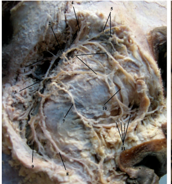
Fig. 1. Atypical branching of the extracranial part of the facial nerve. Type II.

1 - the main trunk of the facial nerve; 2 - temporofacial branch; 3 - cervicofacial branch; 4 - temporal branches; 5 - zygomatic branches; 6 - superior buccal branches; 7 - inferior buccal branch; 8 - marginal mandibular branch; 9 - cervical branch;