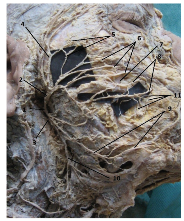
Fig. 3. Branching of the extracranial part of the facial nerve. Intermediate Type V-VI.

1 - the main trunk of the facial nerve; 2 - temporofacial branch; 3 - cervicofacial branch; 4 - temporal branches; 5 - zygomatic branches; 6 - superior buccal branches; 7 - parotid duct; 8 - inferior buccal branch; 9 - marginal mandibular branch; 10 - cervical branch; 11 - terminal branches within the muscles of facial expression.