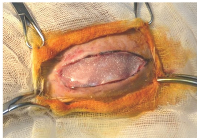
Fig. 3. Attachment of a polymer film to the wound.

slaughter of animals using experimental animals”, approved by the order of the Ministry of Health of Ukraine and the Law of Ukraine “On the Protection of Animals from Cruel Treatment” (No 1759-VI of 15.12.2009) and the rules of the European Convention for the Protection of Vertebrate Animals used for experimental and other scientific purposes [12].