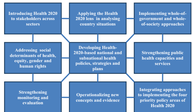
Fig. 2. The nine package components of Health 2020.

to achieve in terms of equitable health improvement? What multisectoral policies and strategies will it use, for example for noncommunicable diseases? The Health 2020 package of tools and instruments is intended to help here. In terms of public health, analysing the European Action Plan for Strengthening Public Health Capacities and Services and its associated self-assessment tool will also give clear guidance. Health 2020 is not for academic study and dusty shelves; it is a guide for practical implementation.