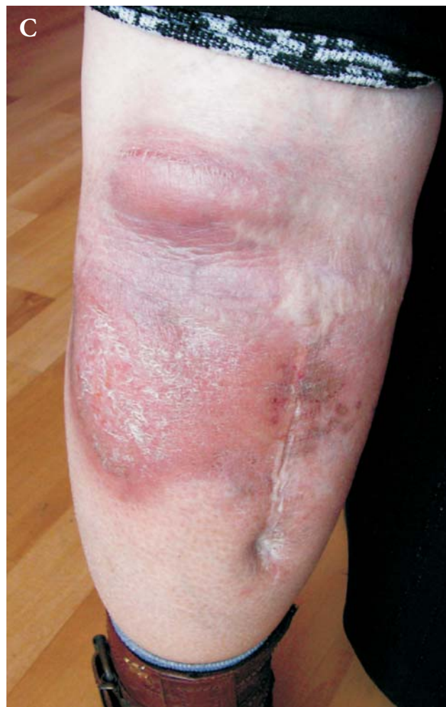
Fig. 1. Cutaneous involvement in sarcoidosis. Here is presented a wide variety of skin lesions caused by sarcoidosis: from simple isolated papules (A), to infiltrated extensive disfiguring plaques (B, C).