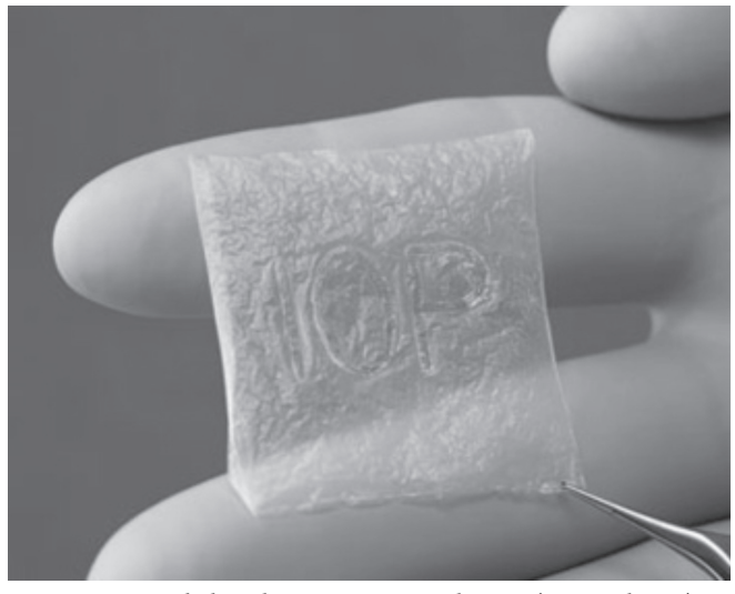
Fig. 2. Lyophilized amniotic membrane (natural size).

Among our patients, the majority (52.8%) had deep ulcers, the second largest group had keratouveitis with ulcers (22.6%). Herpetic keratitis (7.5%) and corneal ulcer in systemic diseases (11.3%) had a relatively smaller incidence.