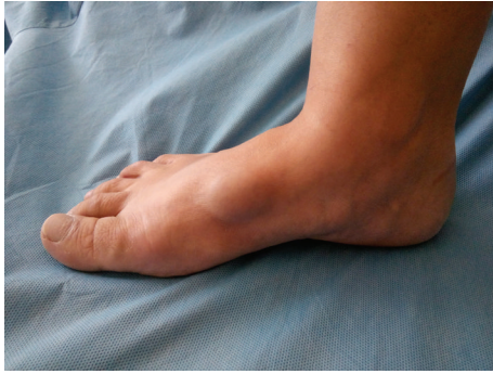
FIGURE 1: Appearance of a venous aneurysm of the medial marginal vein of the foot initially diagnosed as a foot hygroma (patient is in upright position).