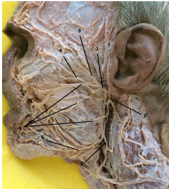
Figure 1. Extracranial branching of the facial nerve.

1 – temporofacial division; 2 – cervicofacial division; 3 – temporal branches; 4 – zygomatic branches; 5 – buccal branches, 6 – marginal mandibular branch; 7 – cervical branch.