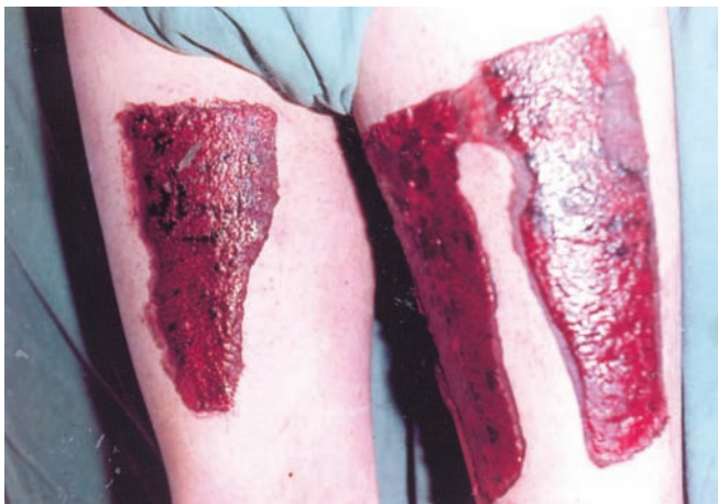
Fig. 3. The azo compound membrane on the surface of the donor area.