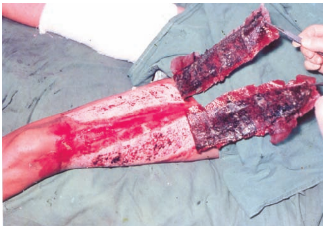
Fig. 5. Membrane removal.