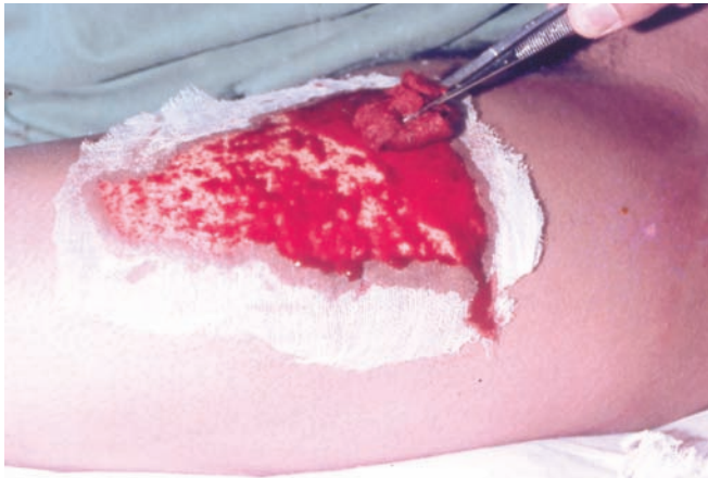
Fig. 1. Application of the azo compound solution.