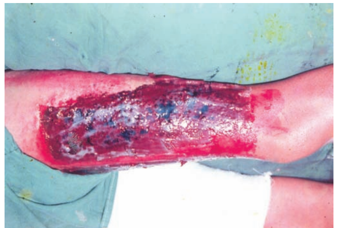
Fig. 4. Membrane surface covered with Vaseline.