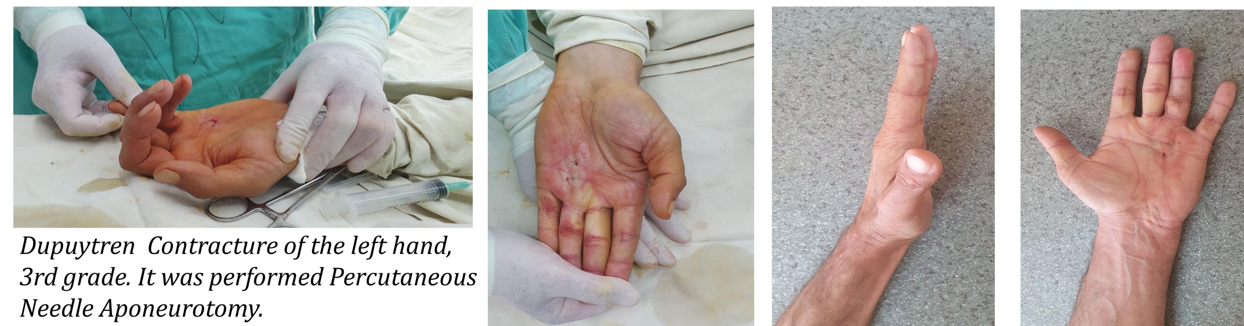
Dupuytren Contracture of the left hand, 3rd grade. It was performed Percutaneous Needle Aponeurotomy.

Or can be used as the first stage of surgery, in case of advanced contractures (Stages III-IV Tubiana), which can result in skin defects.