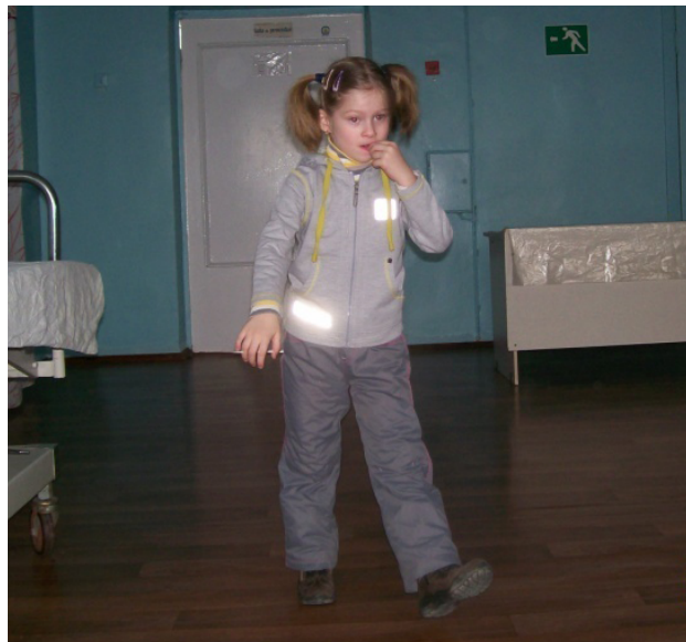
Fig. 2. After operation. In 2 years after operation neurological disturbances of type A passed to type D.