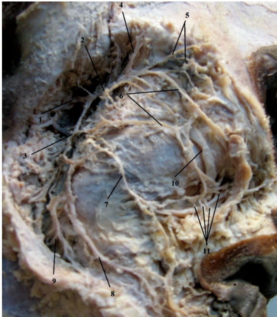
Fig. 1. Atypical branching of the extracranial part of the facial nerve. Type II.

1 – the main trunk of the facial nerve; 2 – temporofacial branch; 3 – cervicofacial branch; 4 – temporal branches; 5 – zygomatic branches; 6 – superior buccal branches; 7 – inferior buccal branch; 8 – marginal mandibular branch; 9 – cervical branch; 10 – parotid duct; 11 – terminal branches within the muscles of facial expression.