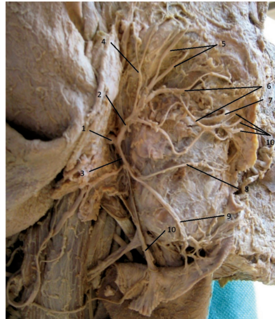
Fig. 2. Atypical branching of the extracranial part of the facial nerve. Type IV

1 – the main trunk of the facial nerve; 2 – temporofacial branch; 3 – cervicofacial branch; 4 – temporal branches; 5 – zygomatic branches; 6 – superior buccal branches; 7 – inferior buccal branch; 8 – marginal mandibular branch; 9 – cervical branch; 10 – parotid duct; 11 – terminal branches within the muscles of facial expression.