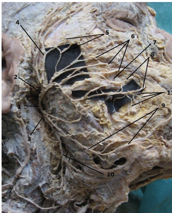
Fig. 3. Branching of the extracranial part of the facial nerve. Intermediate Type V-VI.

1 – the main trunk of the facial nerve; 2 – temporofacial branch; 3 – cervicofacial branch; 4 – temporal branches; 5 – zygomatic branches; 6 – superior buccal branches; 7 – parotid duct; 8 – inferior buccal branch; 9 – marginal mandibular branch; 10 – cervical branch; 11 – terminal branches within the muscles of facial expression.